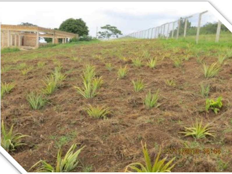
Planted over 1000 pineapples