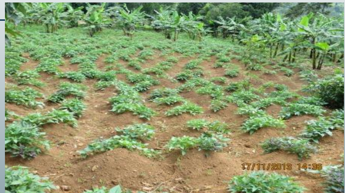
We planted a new crop of a sweet potato garden below the houses