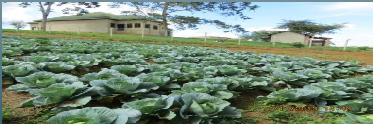
Cabbages soon ready for harvesting