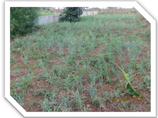
Onions garden between the sanctuary and new dining block