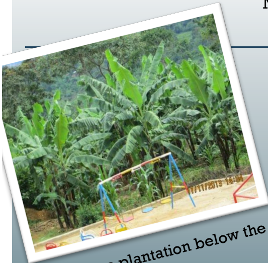
Lush banana plantation below the houses

New developments at ACV with face lift of variety of gardens