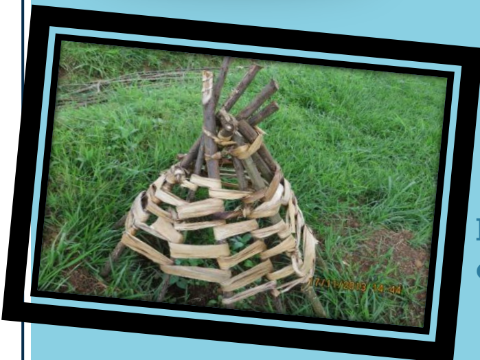
Mango tree sheltered from being eaten by goats