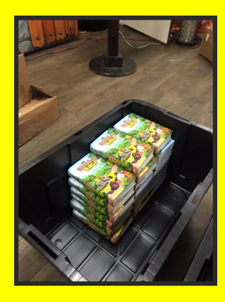
All kids in the lower primary grades were given an Adventure Bible.