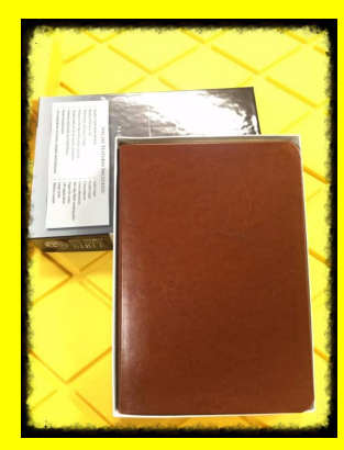
This incredibly beautiful leather study Bible was given to all kids in secondary school. All ACV staff received one as well.