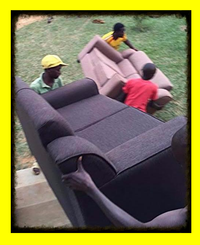
The young boys carrying the new furniture into all the houses.

This was an exciting day. A day that we got to remove all the OLD furniture and bring in the NEW. God has provided new couches for the sitting rooms in six homes. This was a day of rejoicing. A generous donor gave monies to bless these kids and the mommas with new furniture. Thank you Jesus for your faithful provision!