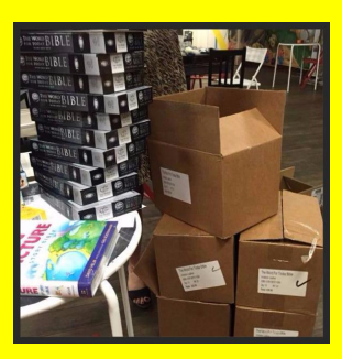
Loading up the Bibles to take to Uganda