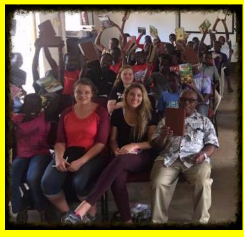
Bibles in the hands of the KIDS!