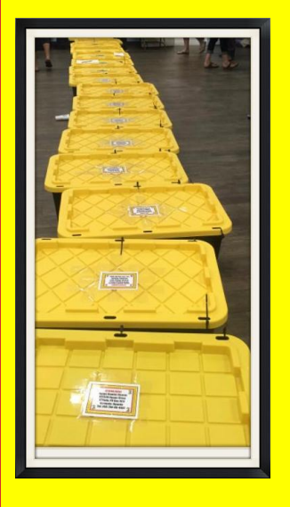
All these totes loaded with Bibles and supplies to bring to our loved ones at ACV